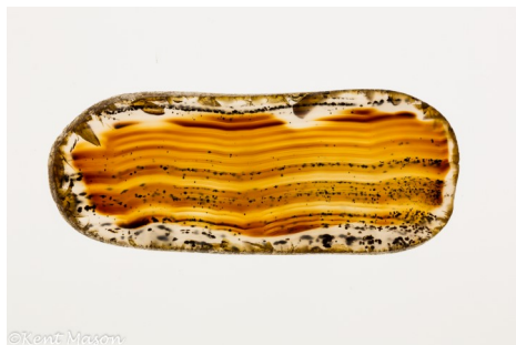
Montana Agate Slab

Agate is a mineral that presents itself to us as rock—just plain old rock. But cut that rock open and you may find amazing beauty. Quality agate is considered a semiprecious gem stone, and agate cabochons are sought after for inclusion in craft jewelry. This program will tell the story of agates—how they fascinate us; where they are found; how they are formed; where they fit in mineral world; and most of all, what they look like. No two agates look the same. There is fantastic variety in their patterns and beauty. The program will close with a photo album of beautiful agates from around the world.